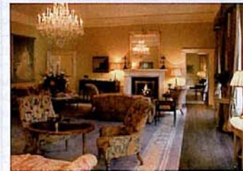
Clockwise from top: La Mansión at the Four Seasons; La Concha; the Merrion; the Liberty Hotel

Before you book your stay, visit continental.com and click "hotel."